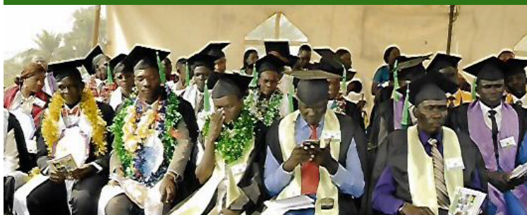
Api Student's Graduation