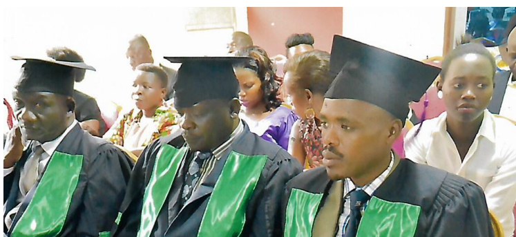
Api Teaching Staff