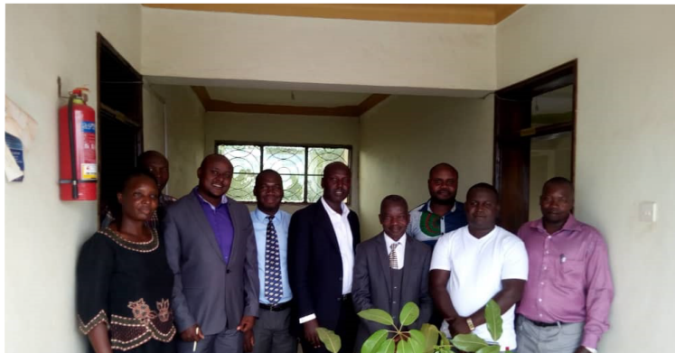
Api Governing Council